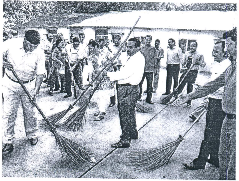
Corporate Office, New Delhi