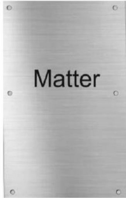
Inauguration Plaque Indicative Representation