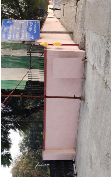
Location of the Board to be fixed on existing grills over boundary wall as per item description in BOQ