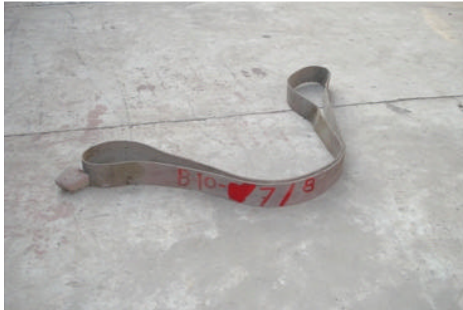
(Cooling Line Stand)