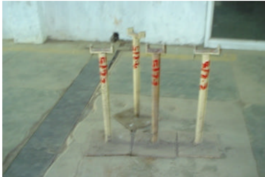
(Cooling Line Stand)