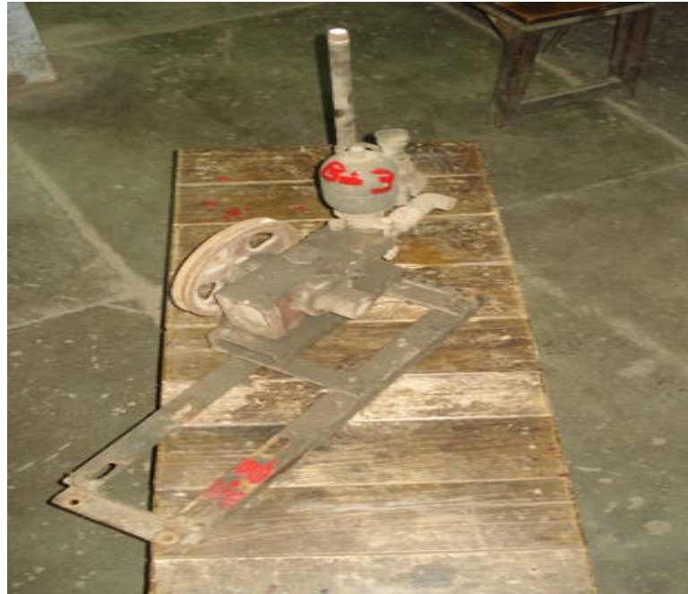
(Foot Operated Pump)