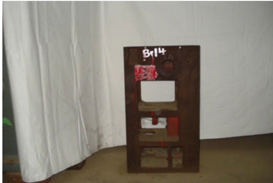
(Lathe Pedestal, Attachment for Pipe Bending)