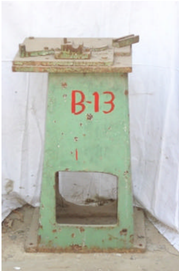
(Briquetting Machine without wheel)