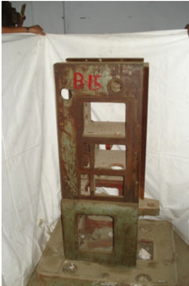
(Incomplete Machine Body)