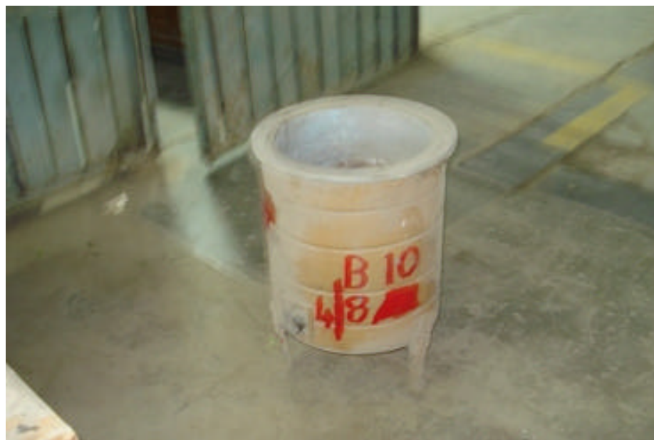
(Oil Tank with Pump)