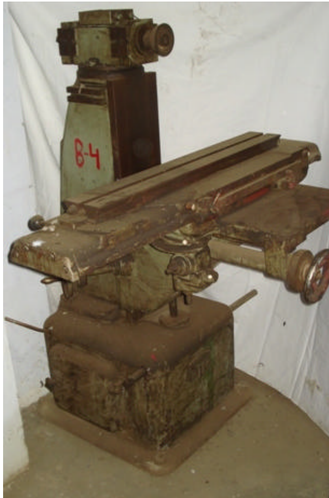
(Tool Cutter Grinder)