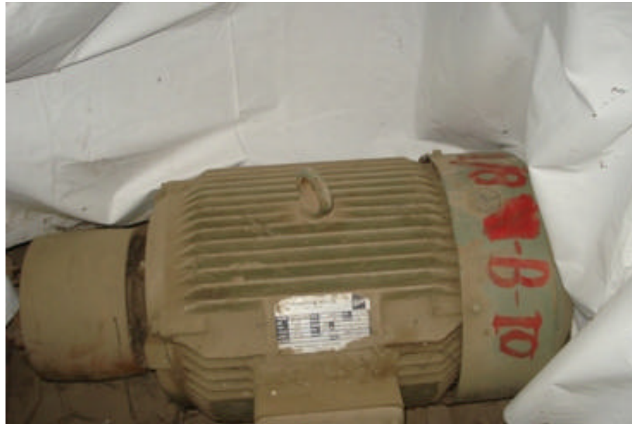
(Machine with wheels)