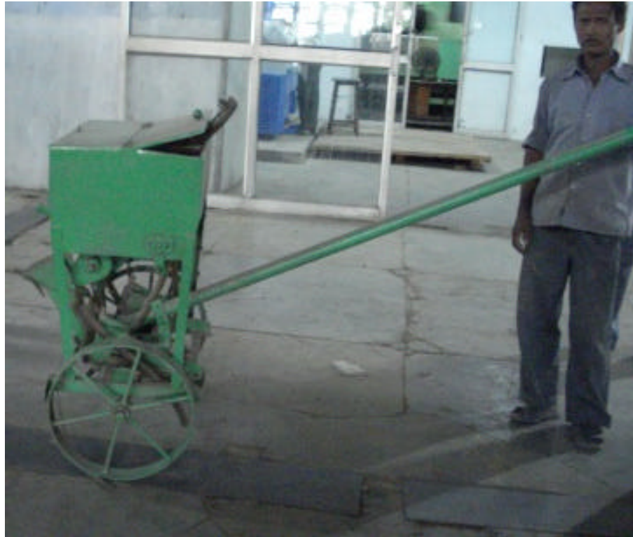
(Seed-cum -Fertilizer Drill)