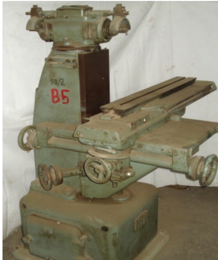
(Tool Cutter Grinder)