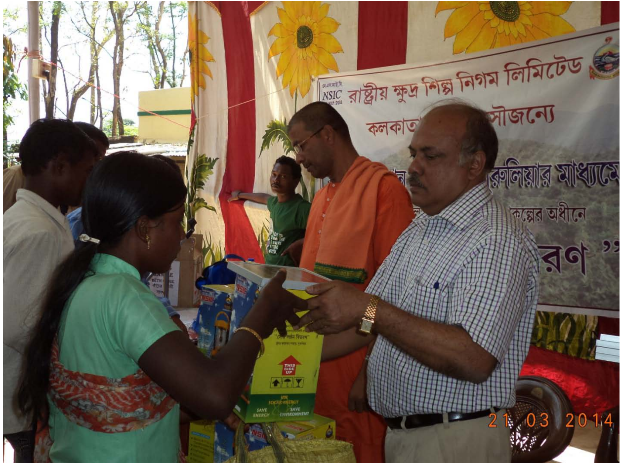
Solar Lantern distributed in Ayodhya Hills