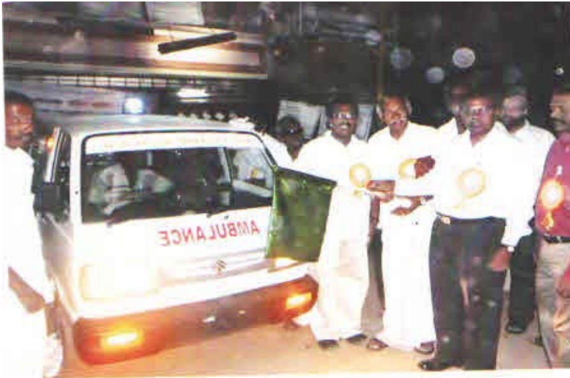
Ambulance Van for the Medical Assistance of Mentally Challenged

Nature of Project : Medical Services Programme for the Mentally Challenged Persons by providing one Ambulance Van and running cost for one year.