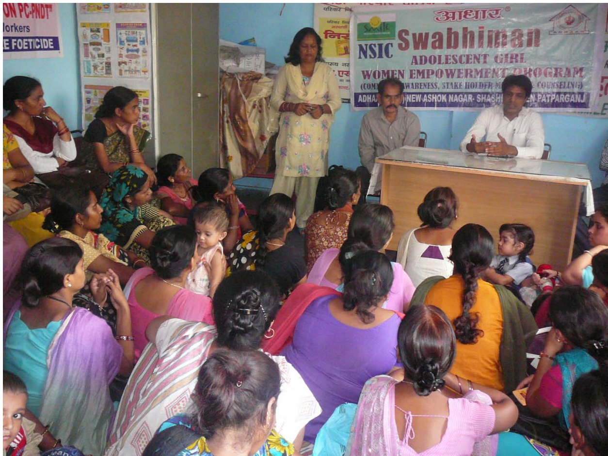
Workshops on Reproductive and Child Health Care Needs

Nature of Project : Empowering girl child and women of low socio-economic strata by making them aware about healthy living practices by conducting workshops on their reproductive and child health. Capacity building of the cadre of Female Community Health Educators.