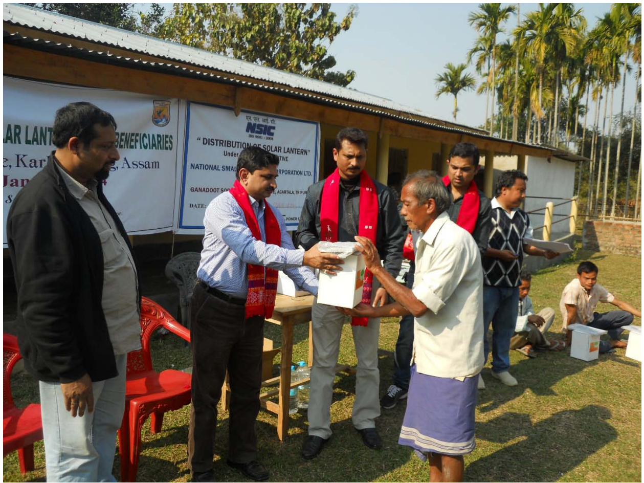
Distributed Solar Lanterns in Karbianglong, Assam