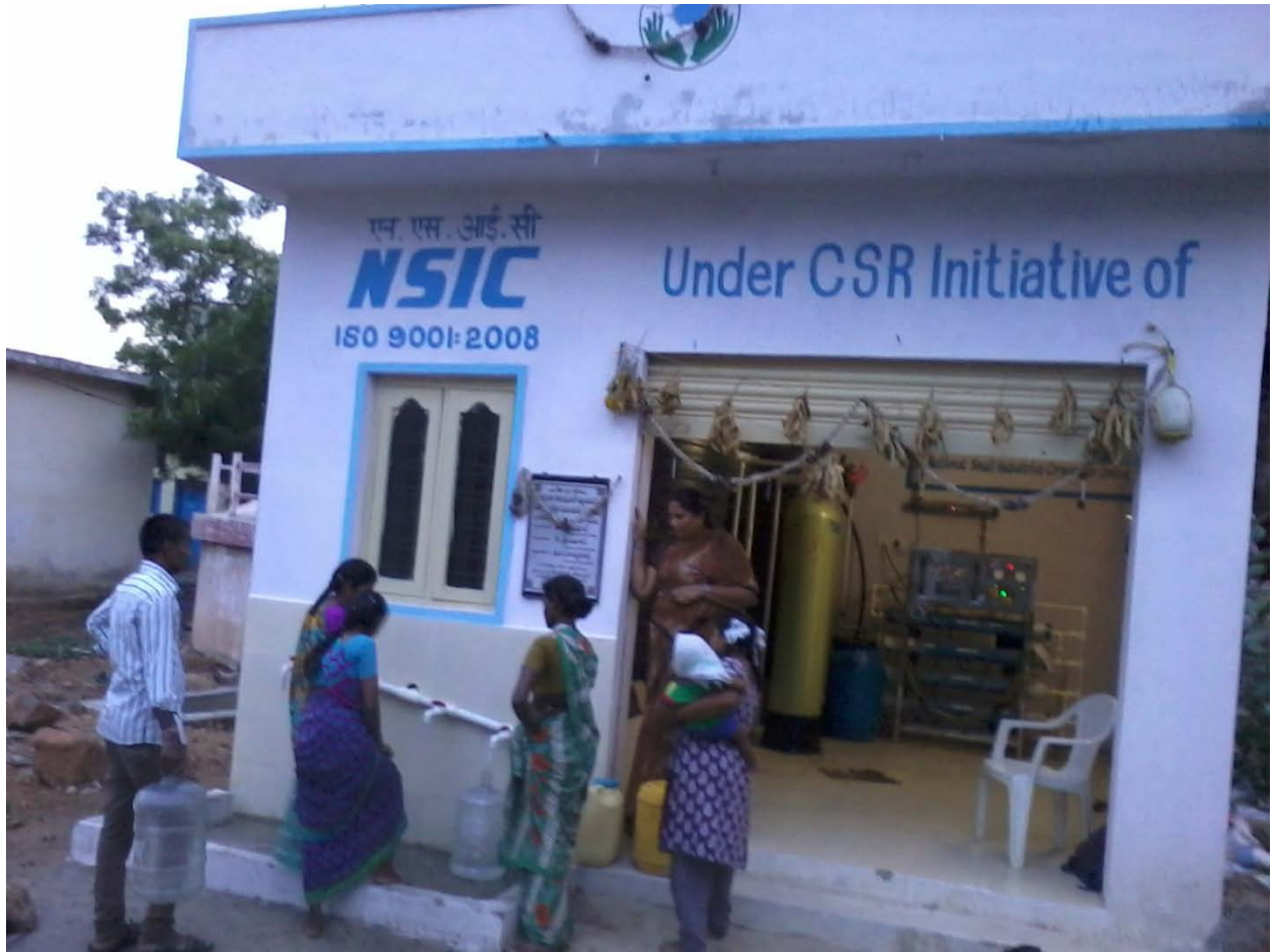
R.O. Water Treatment Plant in village Boduppall