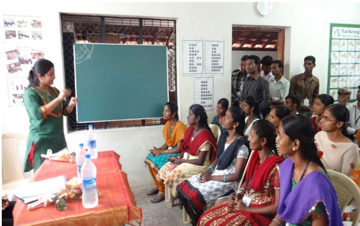
Skill Development training to the Un-Employed youth

Training of school dropouts and un-employed youth in repairing of domestic electrical & electronic appliances to strengthen their quality of life in socio economic arena.