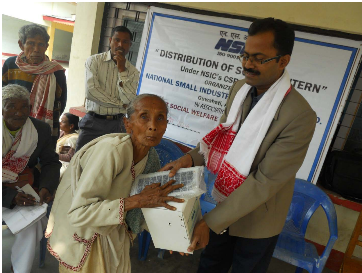
Dispelling Darkness in Dhemaji, Assam

Nature of Project: Distributed Solar Lanterns in the villages of Assam, Tripura and Manipur. These villages where Solar Lantern have been distributed were not facilitated with electricity.