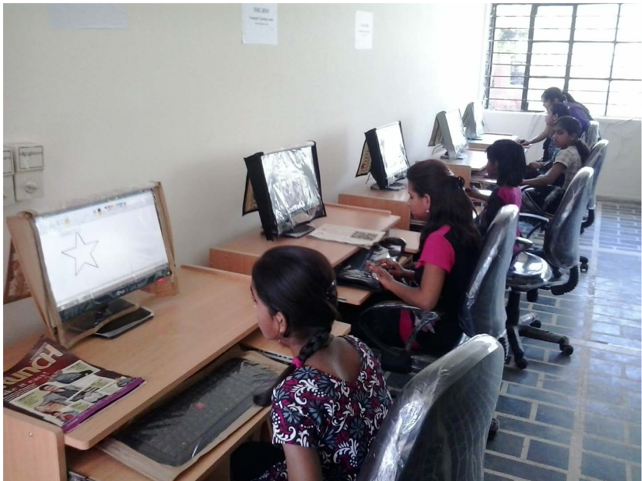
Free Computer Learning Centre

Nature of Project : Setup Computer Training Centres for Disabled and Under-Privileged children in Delhi so they can also be the part of the Information Technology.