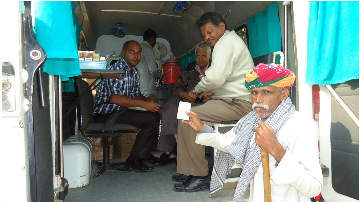
Free Medical Checkups and Medicines

Nature of Project : The cost of running the Mobile Medical Unit funded by NSIC for one year. This MMU runs five days in a week at specified locations of Delhi & NCR and facilitates free medical checkups and gives medicines free of cost.