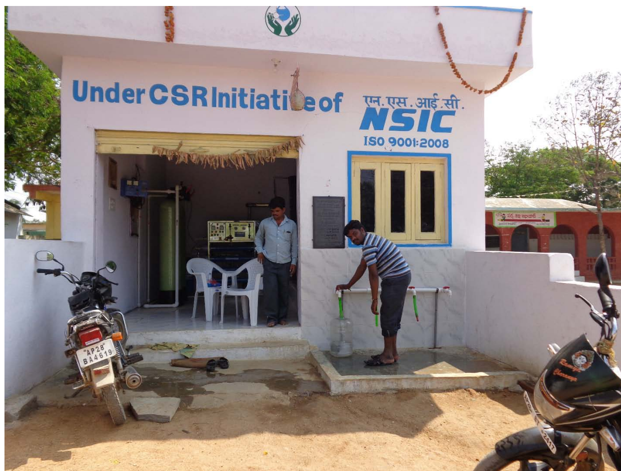
R.O. Water Treatment Plant in village Adraspally

Nature of Project: Setup of R.O. Water Treatment Plant in village Adraspally and Boduppal of Rangareddy District of Andhra Pradesh to provide Safe Drinking Water to the rural population of area as the water quality is hard and alkaline in nature.