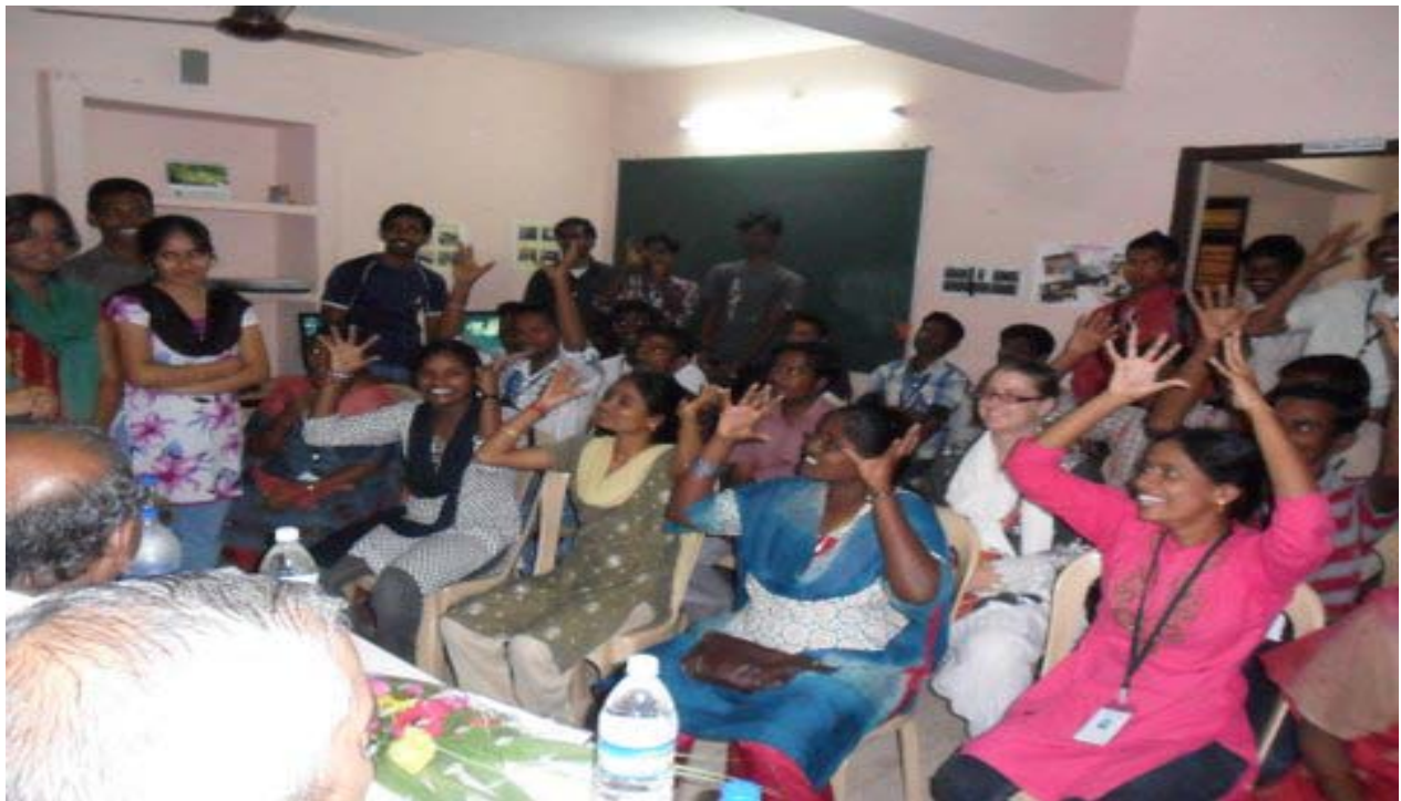
Vocational Training to Deaf Students in progress.

Nature of Project Setup Vocational Training Centres at Puducherry and Thanjavur by providing Computers, Software, Laser Printers, UPS, Computer Table, Chairs and Salary of Instructors at each centre.