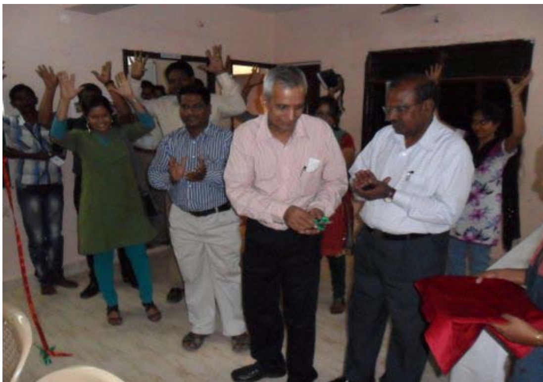
Computer training Centre for Deaf

Nature of Project: Running Cost of Computer Training Centre already set up by NSIC at Puducherry and Thanjavur for one year.