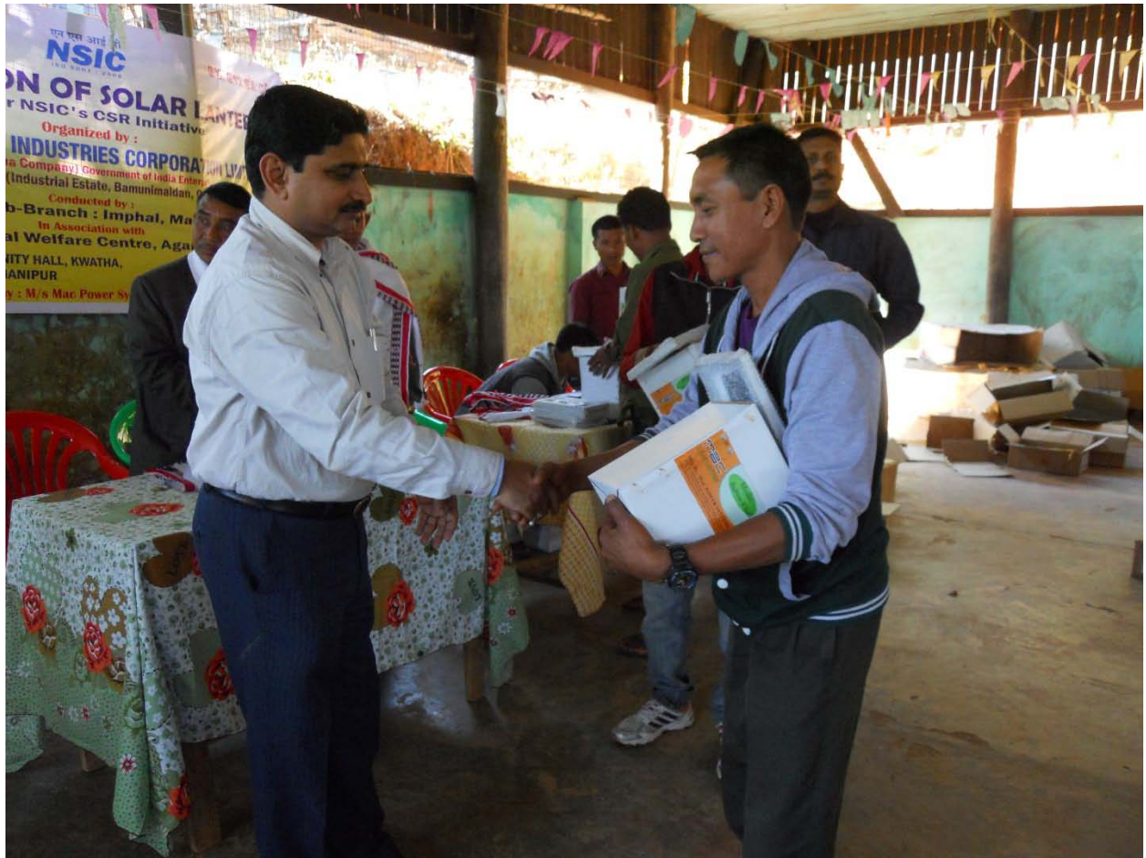
Solar Lantern distributed at the village of Manipur