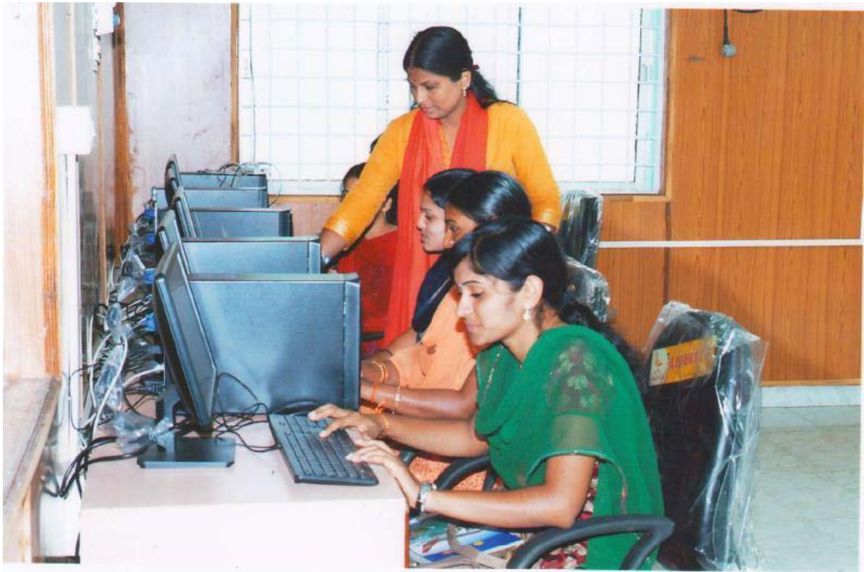
Computer Training Course

Nature of Project: Setup Incubation Centre for the training in Computer & Beautician Course for the Unemployed youth of state.