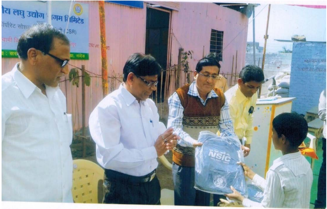
Education facilities to children

Nature of Project: Provided Educational Facilities to Under Privileged Children.