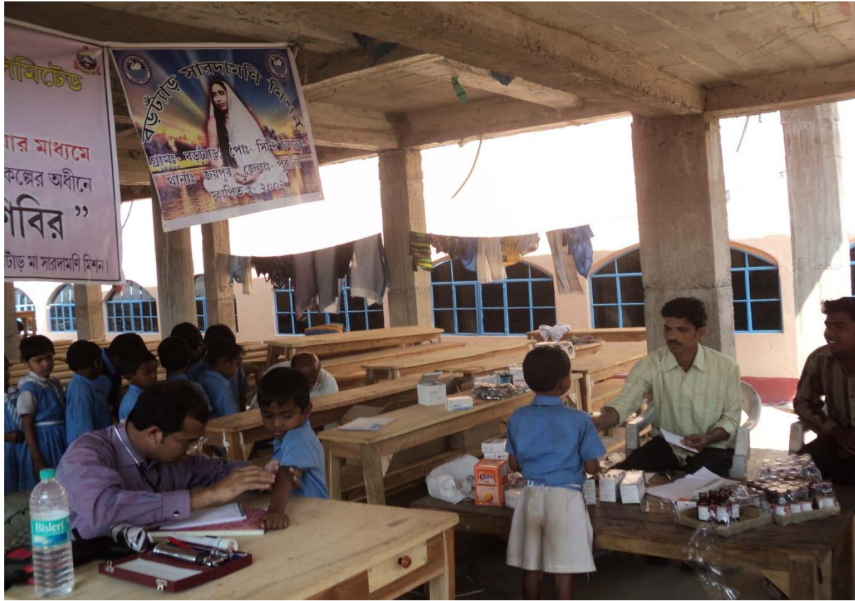
Medical Facility in two schools of village Bartand and Kashipur