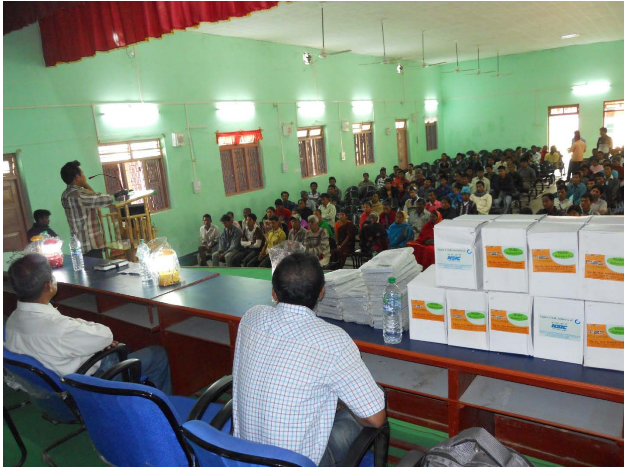
Solar Lantern distributed at the village of Tripura