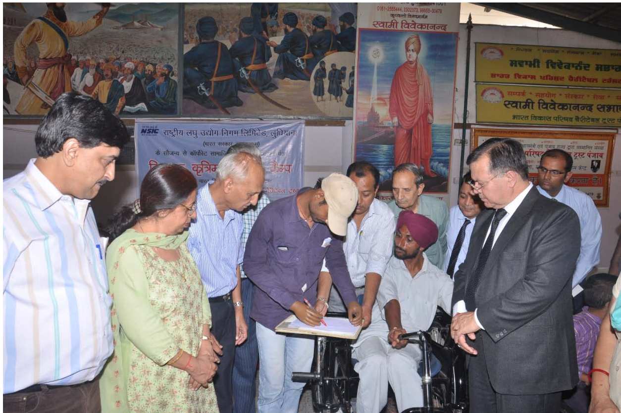
Need Specific Artificial Limbs for the Disabled

Nature of Project: Provided Artificial Limbs, Wheel Chairs, Hearing Aid, etc. to the Physically Challenged persons in order to help them to enter into an arena of main stream of life.