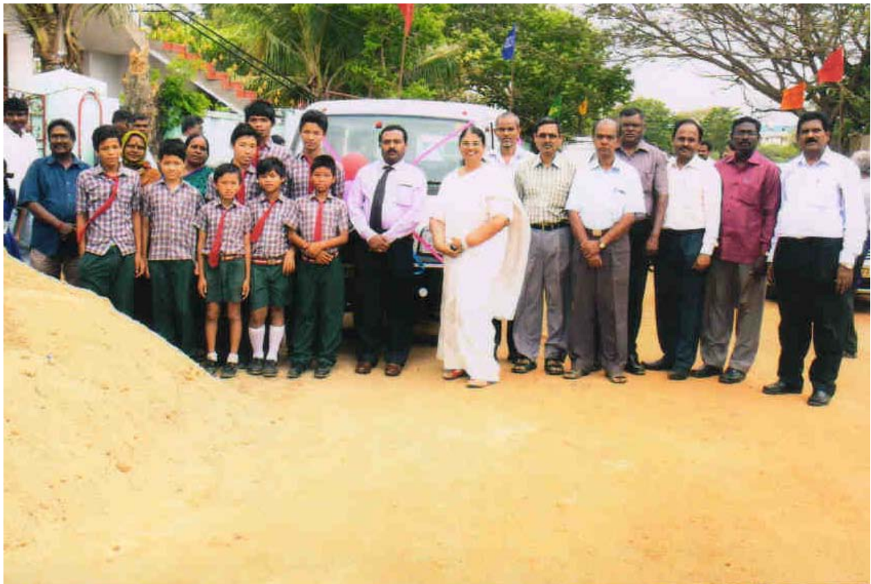
School Van for Orphan Children

Nature of Project: Provided School Van for commuting purpose of Orphan Children from their Orphanage to different schools where they are studying.