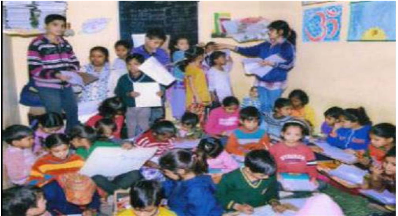
Provided Free Education Facilities to Slum Children

Nature of Project: Provided Educational Facilities to the Under Privileged Children in slum areas of Dakshin Puri.