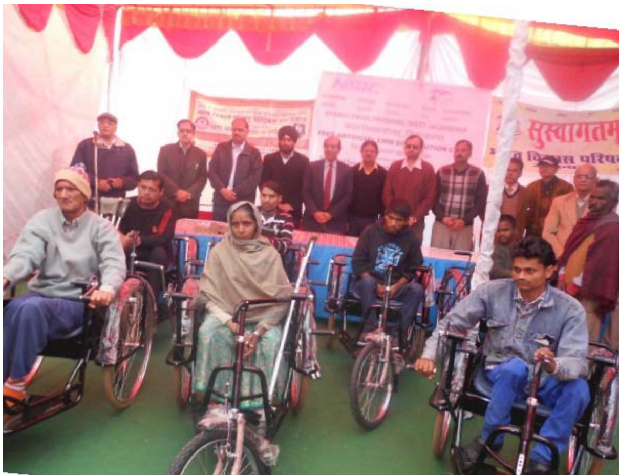
Provided Wheel Chairs, Artificial Limbs etc. at the camp held in Hoshiarpur

Nature of Project: Developed disabled friendly strategies by way of providing Artificial Limbs to the Handicapped People at Hoshiarpur in order to make them the part of mainstream.