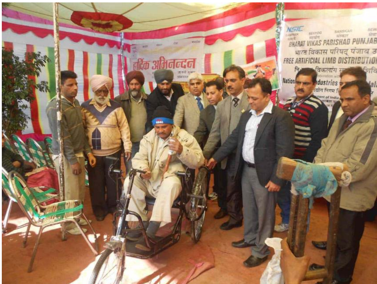
Helped Physically Challenged to become the part of mainstream

Nature of Project: Provided need specific Artificial Limbs, Wheel Chairs, Hearing Aid, etc. to the Physically Challenged Persons at Jalandhar for their Sustainable livelihood.