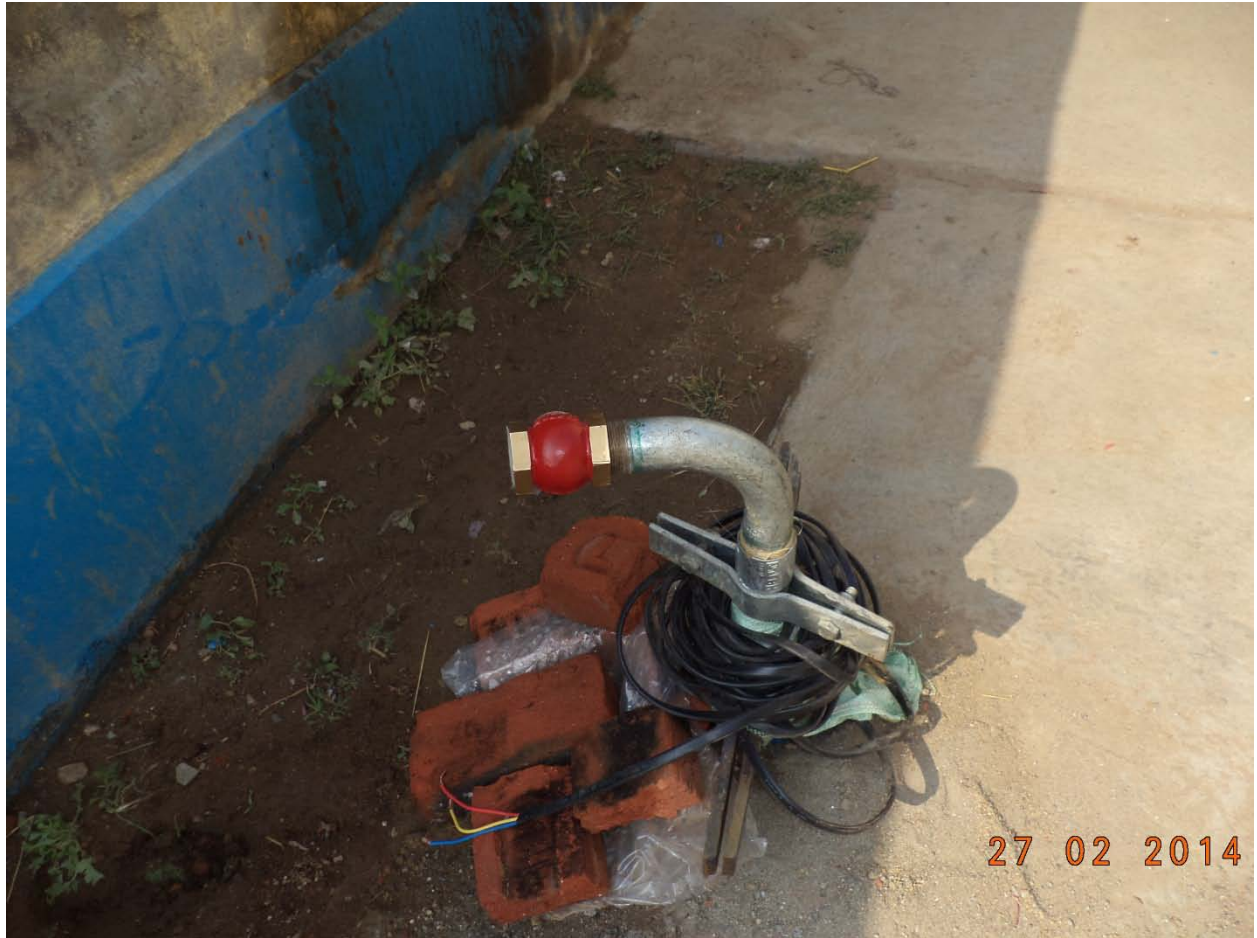
Water Facility in the schools of villages of Kashipur and Bartand