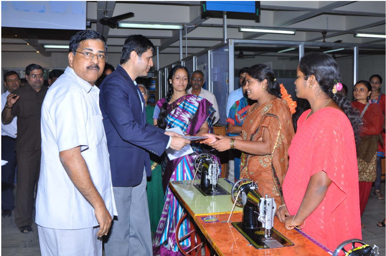
Training in Tailoring and provided with Sewing Machines

Nature of Project: This programme is to empower women of weaker sections of society through Vocational Training in tailoring and provided them Sewing Machines for their livelihood.