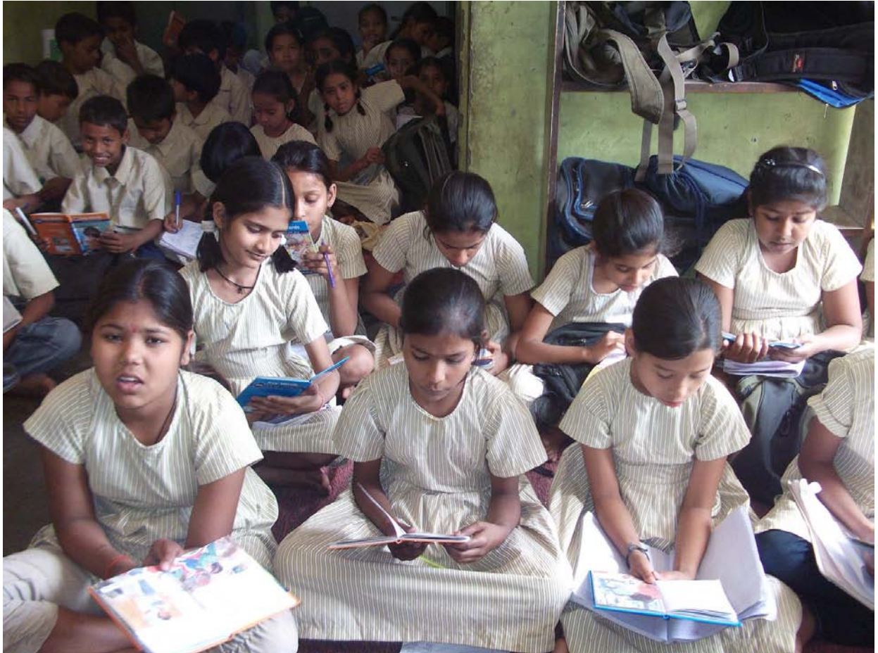
Changing the lives of Under-privileged Children through Education Facilities.