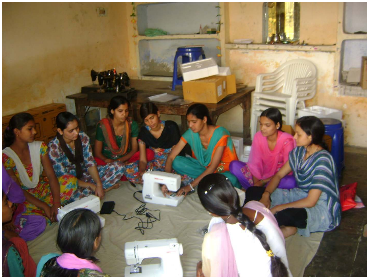
Empowering women through Vocational Skills

Nature of Project: Three months duration course in training of Dress Designing and Tailoring & Distribution of Sewing Machines to trainees to earn their livelihood.