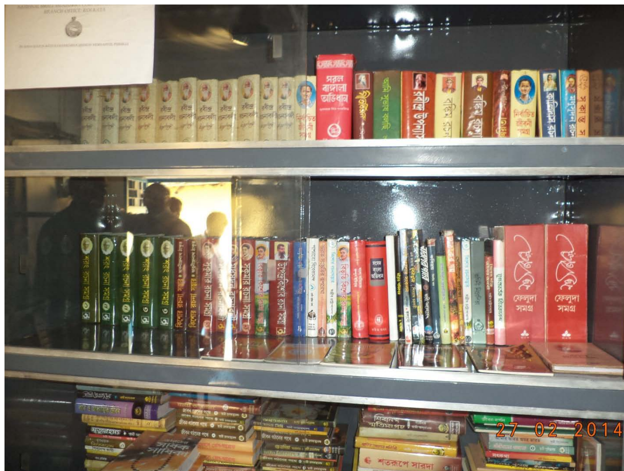
Setup library in the schools of villages Kashipur and Bartand

Provided Medical Facility in two schools of village Bartand and Kashipur of Purulia District of West Bengal (Backward Area).