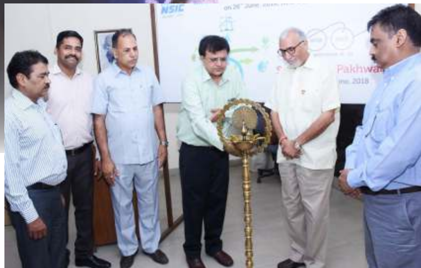
NSIC organises a Seminar on INNOVATIVE TECHNOLOGIES ON CLEANLINESS in association with DLF Industries Association and NRDC.