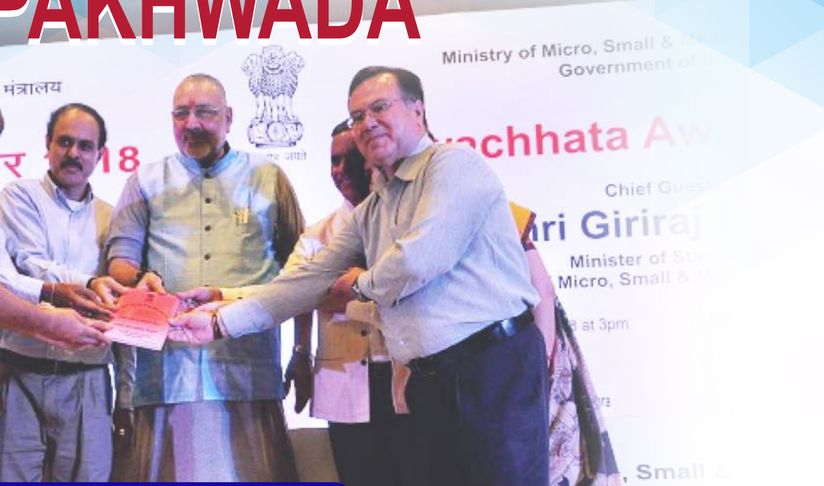
Minister of State (Independent Charge) for Micro, Small & Medium Enterprises confers NSIC Swatchhta Award 2018