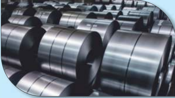
लोहा और इस्पात