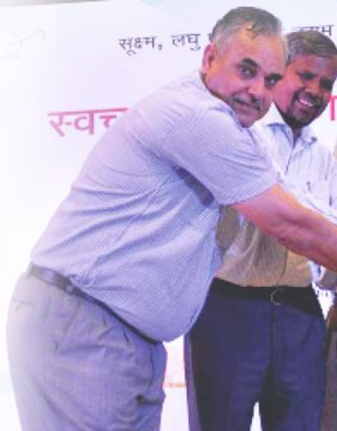
Shri Giriraj Singh, Minister of Ministry of Micro, Small & Medium Enterprises with swachhata