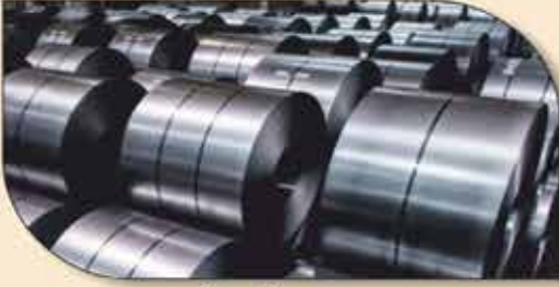
लोहा और इस्पात