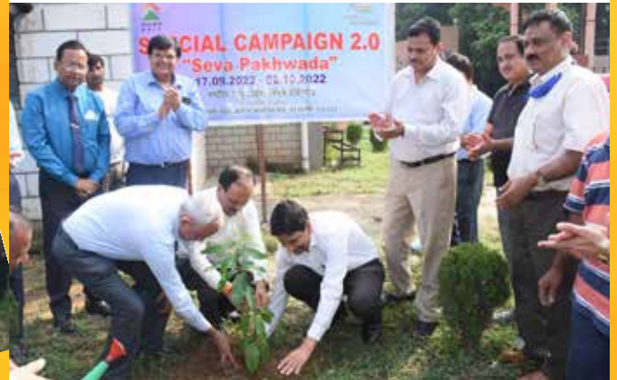
NSIC (Corporate Office) observes "Seva Pakhwada"