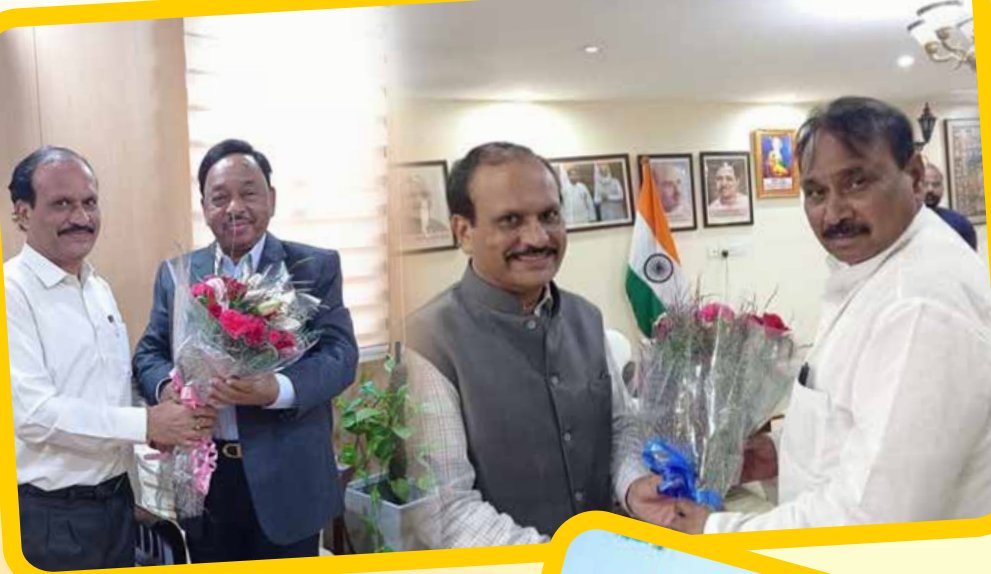
Shri G. Dixit on assuming the charge of CMD, NSIC, greets Shri Narayan Tatu Rane, Hon'ble Cabinet Minister and Shri Bhanu Pratap Singh Verma, Hon'ble Minister of State.