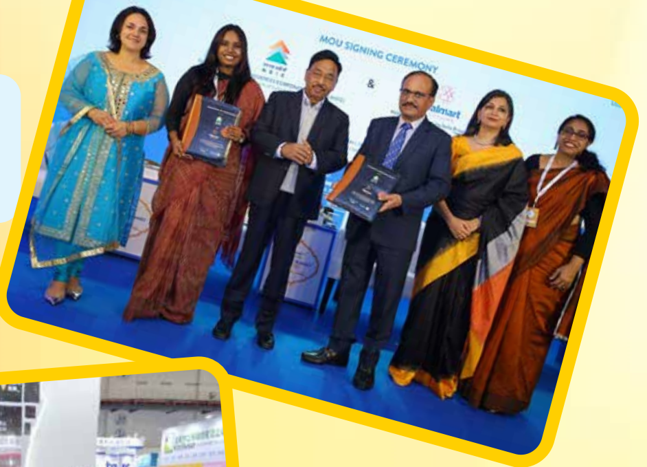
NSIC SIGNS MOU WITH WALMART