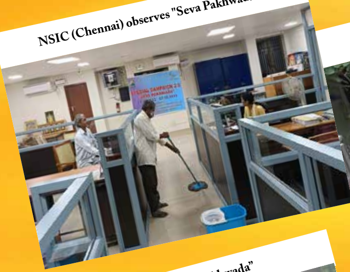
NSIC (Chennai) observes "Seva Pakhwada"