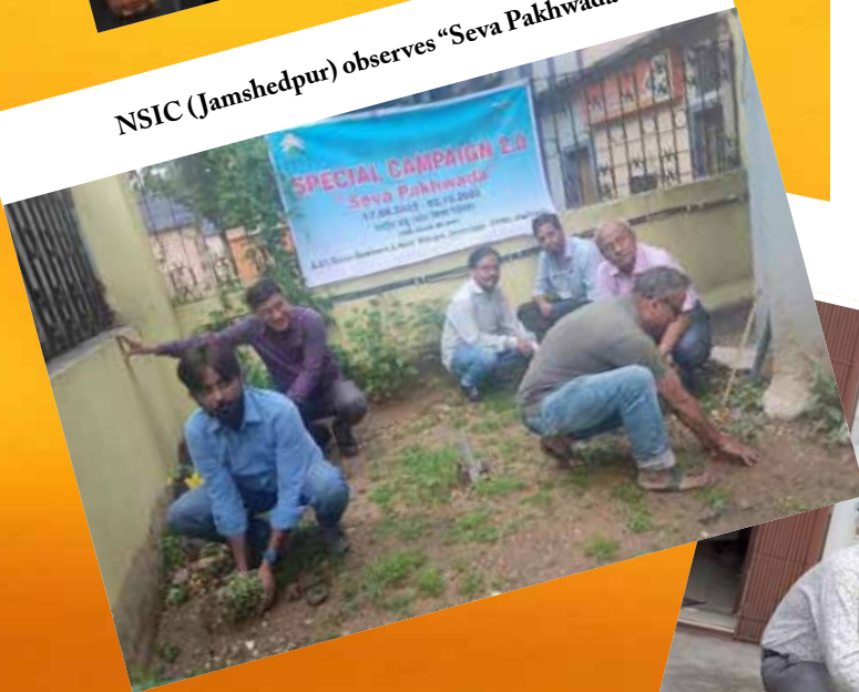
NSIC (Jamshedpur) observes "Seva Pakhwada"