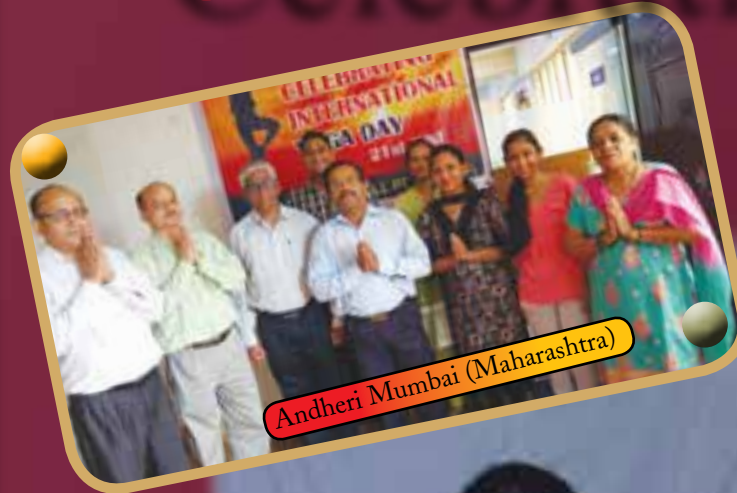
Andheri Mumbai (Maharashtra)