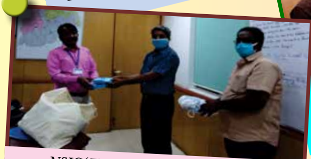
NSIC (Trichy) has handed over masks to Tiruchirapalli Corporation Commissioner.